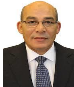
Prof. Dr. Abdel-Moneim El-Banna, Minister of Agriculture and Land Reclamation