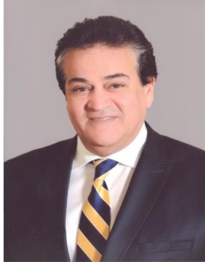
Khaled Abdel Ghaffar Minister of Higher Education & Scientific Research