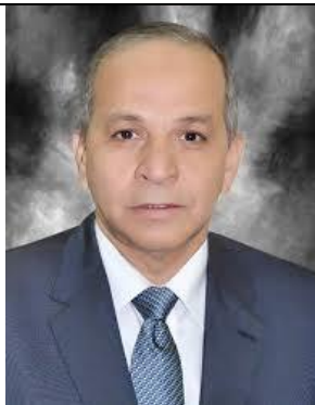
General / Mahmoud Ashmawy Qalyoubia Governor